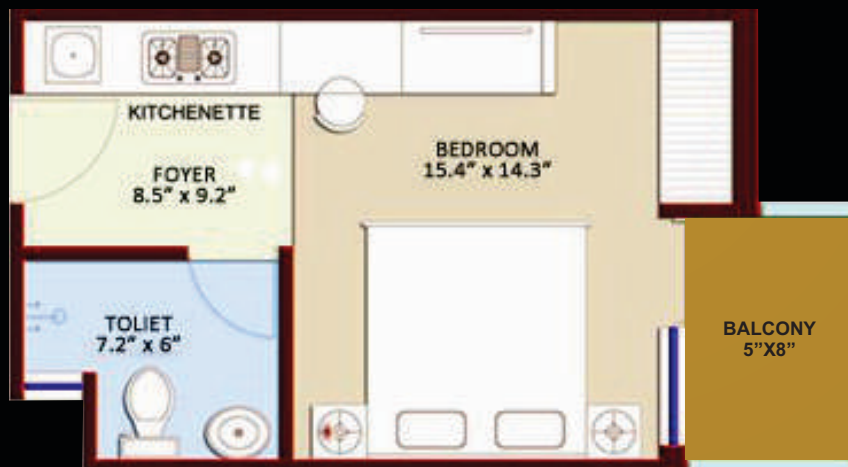
425 Sqft STUDIO APARTMENT